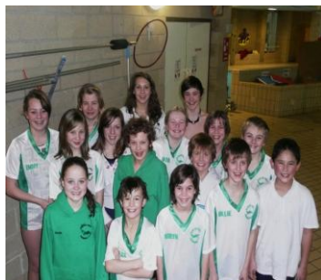
Mini League Team Photo

Please would all swimmers ensure they are on time for the start of the session. This will allow the maximum time in the water to be used for training. Anyone who is late on a regular basis and without good reason will be recorded in the register and the appropriate action